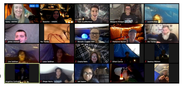
Teens showing off their shelters on Day 3 of Teen Camp Dragonfly!