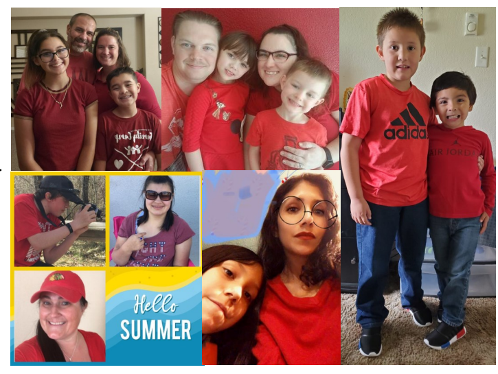
Wear Your Red Best Challenge for the Back To School Family Conference